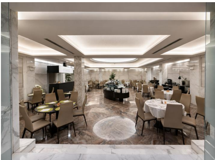
Restaurant “Quattro Stagioni”

If you communicate in advance, the kitchen will try to cater for every special need.